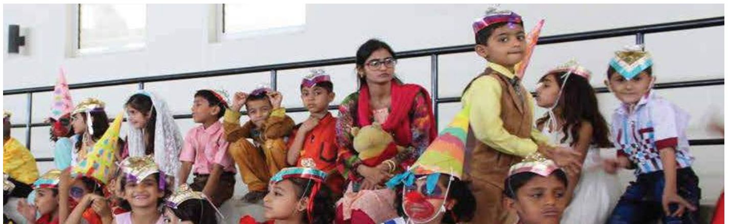
Children enthusiastically participating at Sing a Song Morning.